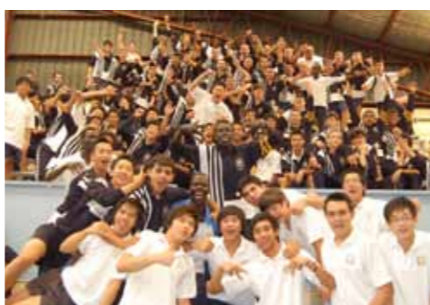
Year 12 support the MCC A Grade team at the Final last week