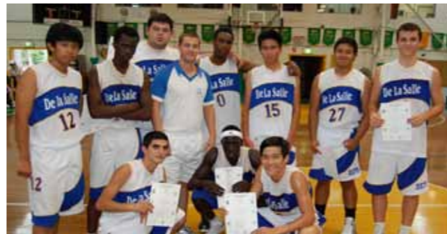
The MCC A Grade Basketball team following their narrow loss in the MCC Grand Final last Thursday against Randwick.