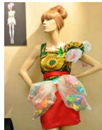
David Machem's 'Origami'

Year 12 Visual Arts students are in the final stages of developing a 'Body of Work' to be submitted for HSC Practical marking.